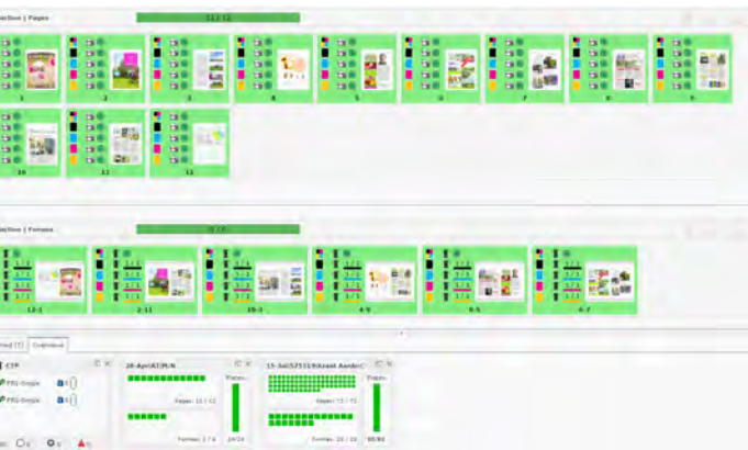
One screen can show pages, plates and device status

Printers who work with remote publishers will appreciate the benefits of Arkitex Portal, which is a collaborative page production system. Portal offers a cost-effective way to help newspaper publishers and printers expand and develop their print business.