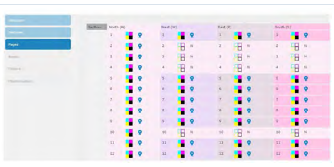
View of in-built planner