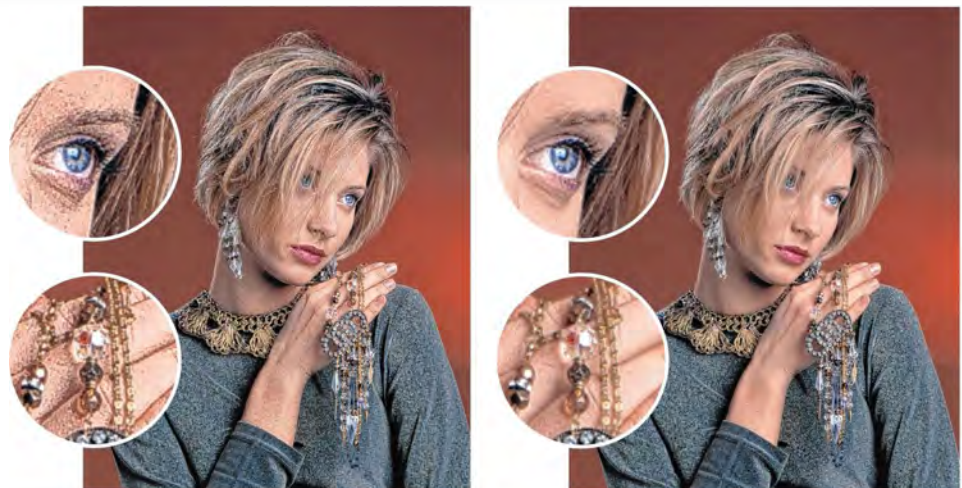
This pair of images shows the advanced skin tone filtering, available in both IntelliTune and OptiInk