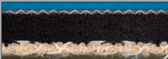
Imprint Robusto : microscopic view