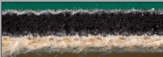
Imprint Rapid-Web : microscopic view